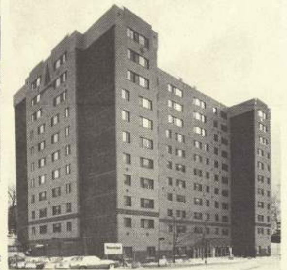
Elderly housing on St. Paul Street has been renovated.