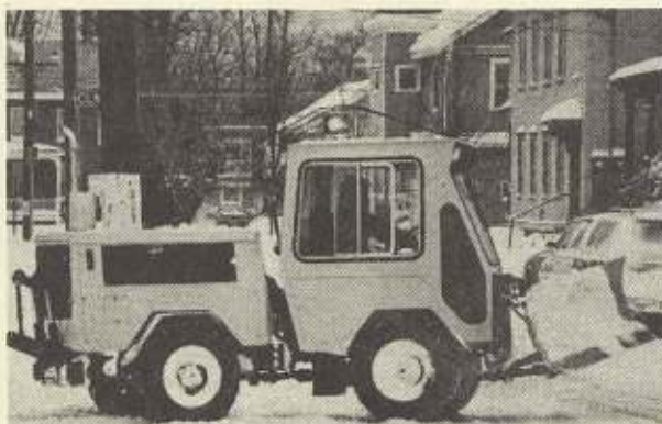
City has modernized its sidewalk and street plows.