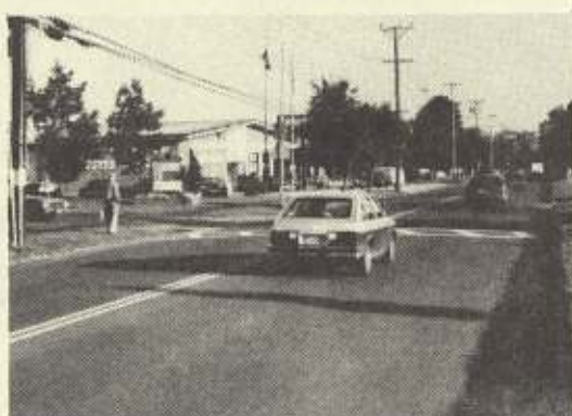
Pine Street repaved in 1986.