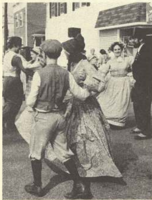
Folk dancers at Old North End Heritage Day.