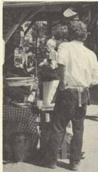
Farmers Market serves many elderly residents.