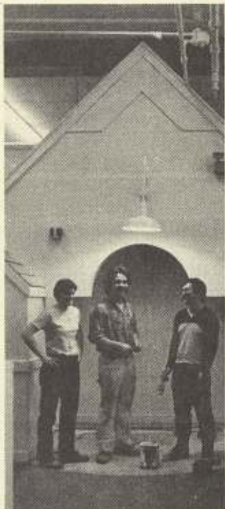
The Burlington Children's Space gets a new paint job from Youth Employment workers.