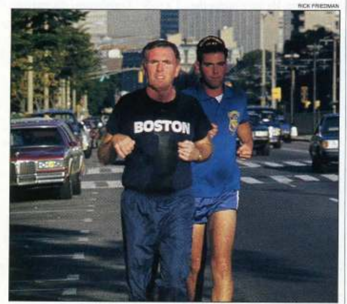
On the fast track: Boston Mayor Raymond Flynn has seen the city thrive as racial tensions ease