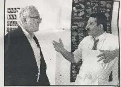
"People are worried about their economic future," says Bernie. "We've got to keep jobs from being shipped overseas and we've got to reinvest in our infrastructure, our education, and environment."

"The United States once ranked first in the world in terms of the wages and benefits we paid our manufacturing workers, the quality of our products and the development of new technology. Today, we lag far behind many other nations in all of these areas. The United States needs a New Industrial Policy which brings