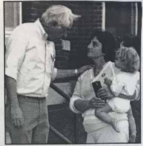
Families covered under Bernie's health care plan would find no hidden payments: no deductibles, no co-payments, and no out-of-pocket costs.

"The legislation I have introduced would cover every American for all necessary medical care."